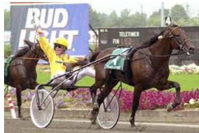
2001 Hambletonian winner Scarlet Knight

*Two-year-old trotting filly CR Kay Suzie sets world records in 1994 and popularizes the use of trotting hobbles.