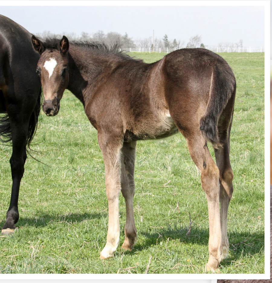
Gunjan Patel photos Bettor's Wish filly out of Try N Keep Up foaled at Hanover in February.

Try N Keep Up is a half-sister to Western Silk, p, 3, 1:50.1s ($1,679,347) and Economy Terror, p, 1:49f ($1,638,534).