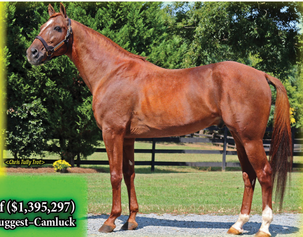
<Chris Tully Trot>

Standing his third season for a $1,500 stud fee Harris Stallion Station • Federalsburg, Maryland harrispainhorses@gmail.com • 410-754-9566