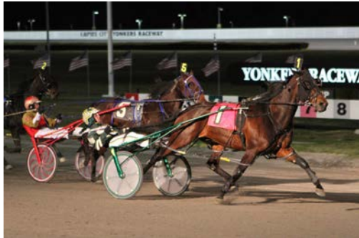
Bettor's Edge is not for sale