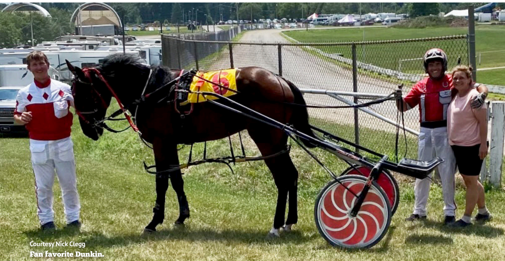
Fan favorite Dunkin.