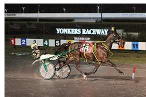
Foiled Again will look to get back on a winning track tomorrow night at Pocono

Foiled Again Looks to Bounce Back at Pocono