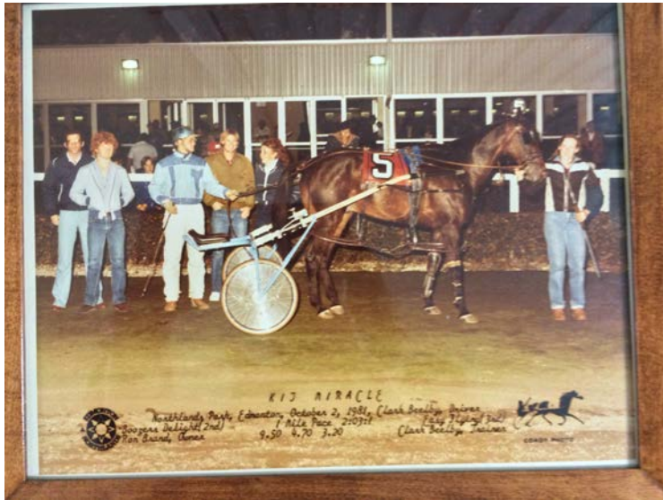
A young Lincoln Chafee (brown coat) in the winner's circle at Northlands Park in 1981.

Lincoln Chafee left home in his twenties to begin a career in the standardbred racing game as a farrier in western Canada and now some 30 years later he is considering a run for the President of the United States. And if it's true that America is indeed the land of opportunity, the former