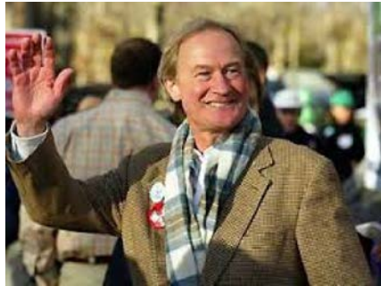
Lincoln Chafee today