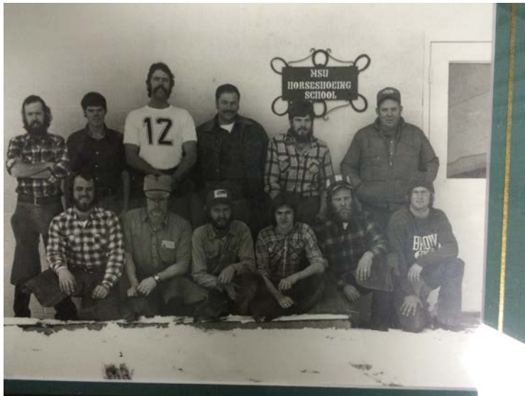
Presidential hopeful Lincoln Chafee (bottom row, far right) with fellow classmates at Montana State Farrier School)

"It was a great time of my life," Chafee said. "Nobody knew anything about my background. It was fun, the money was good. I worked hard. It was just a terrific experience. Calgary and Edmonton, it was just the best."