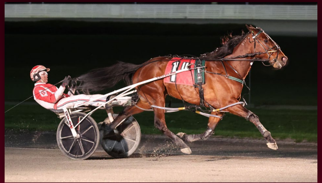
#8: THE IDEAL DANCER A p,8,1:50.1h ($387,873) (American Ideal - Jennas Dancer)