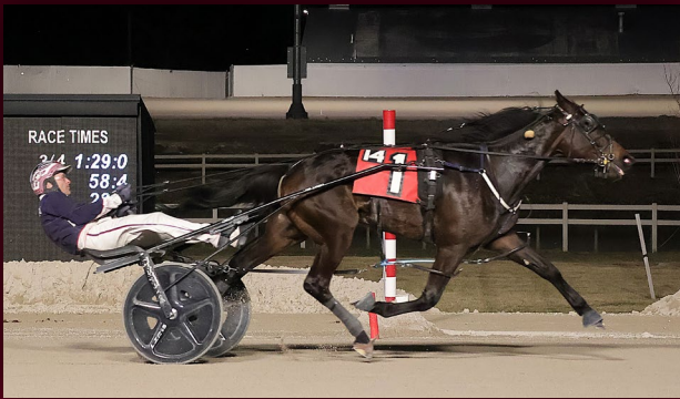
#7: WESLYNN WARRIOR 3,1:59h - '25 ($27,618) (Father Patrick - Weslynn Legacy)