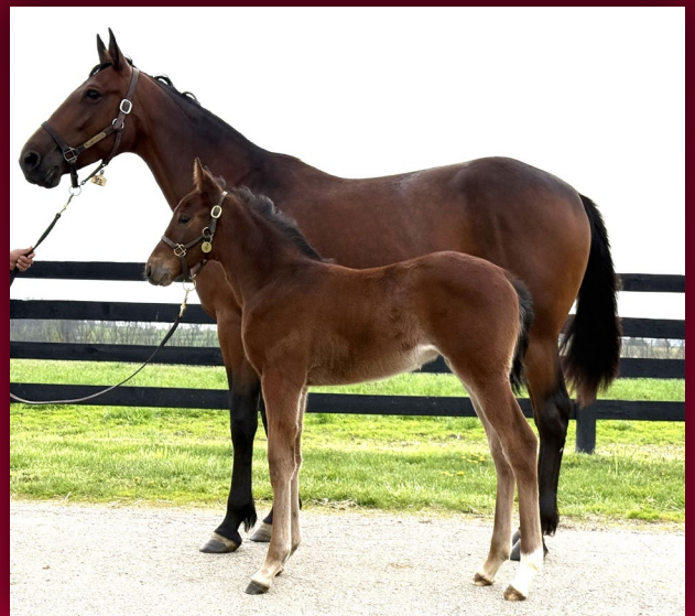
#6: JOLLY MISS MOLLY with 2025 PEBBLE BEACH Filly and in foal to LEGENDARY HANOVER