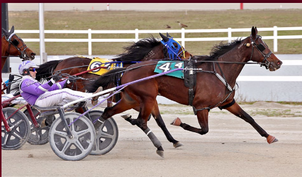
#9: MEMORYNIMAGINATION 3,1:55f ($275,601) (Father Patrick - Fellowship Of Two)