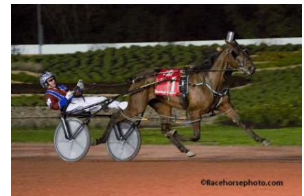
See You At Peelers