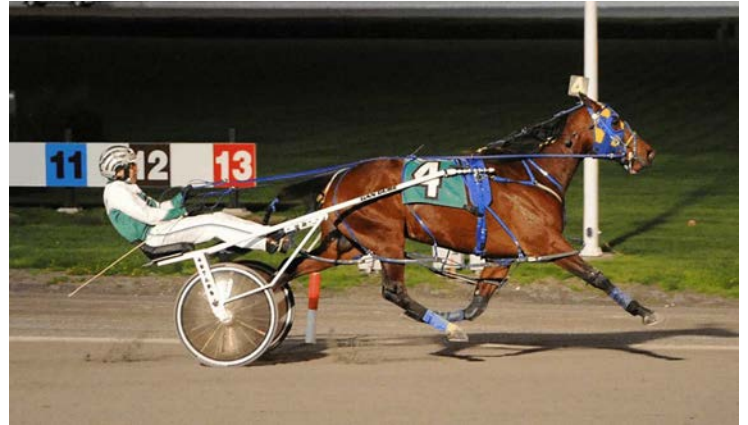
Tomorrowpan in the Blue Chip Matchmaker © Tom Berg