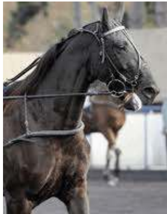
Nouba du Saptel

Meanwhile, in Finland the Finlandia Ajo, a race in the European Grand Circuit-series for elder trotters, was raced