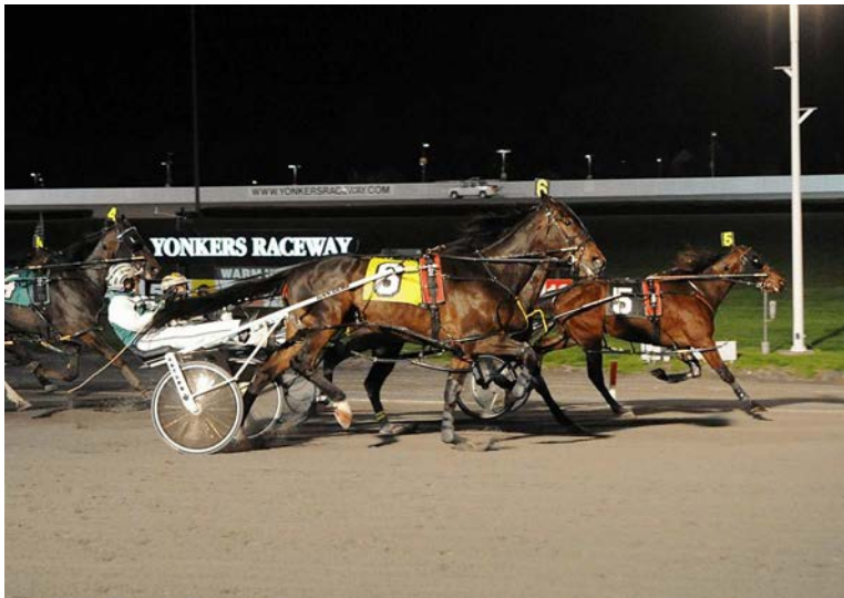
Real Nice Takes the Levy