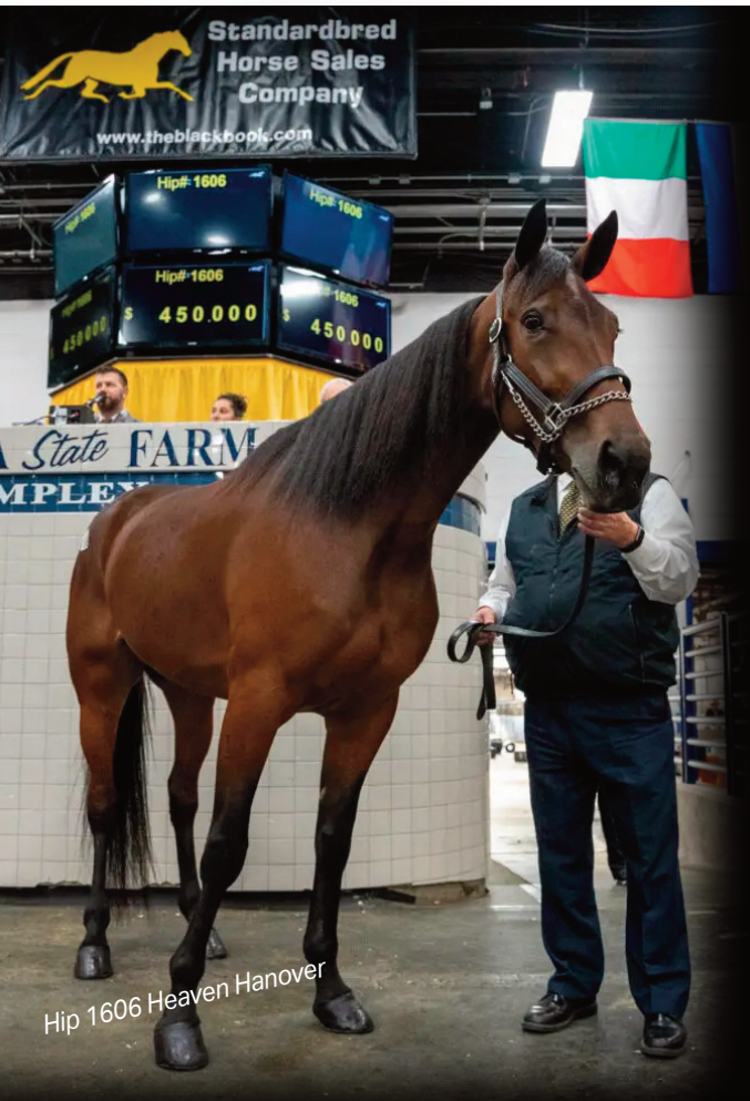
Hip 1606 Heaven Hanover

The 2023 mixed sale concluded with a new gross sales record of $27,972,000 from the two-day auction of broodmares, racehorses, weanlings, yearlings and stallion shares!