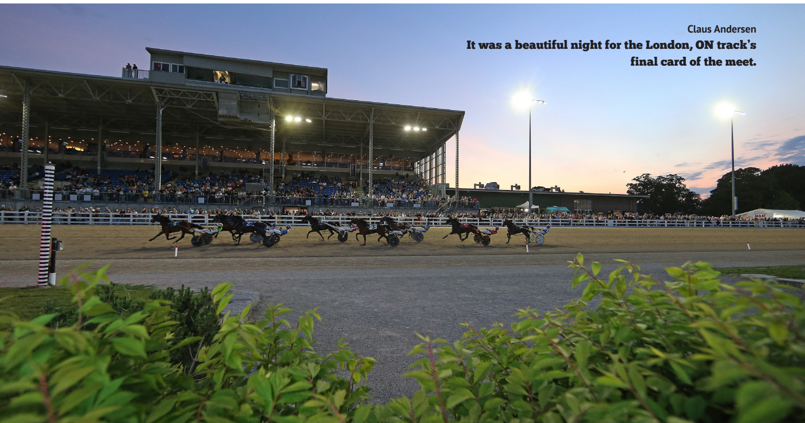
It was a beautiful night for the London, ON track’s final card of the meet.