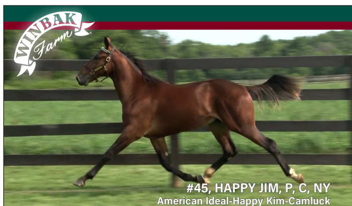
#45, HAPPY JIM, P, C, NY American Ideal-Happy Kim-Camluck