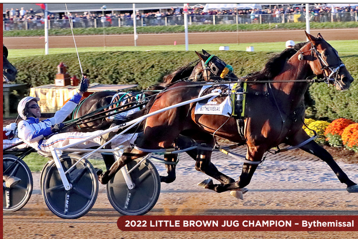
2022 LITTLE BROWN JUG CHAMPION - Bythemissal