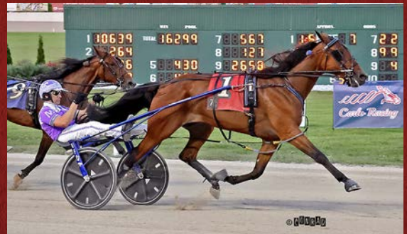
ROSE RUN YOLANDA 3-Year-Old Filly Trotting Champion