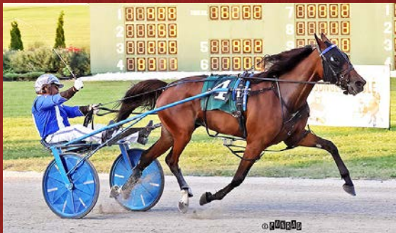
SUGAR INSTEAD 2-Year-Old Filly Trotting Champion