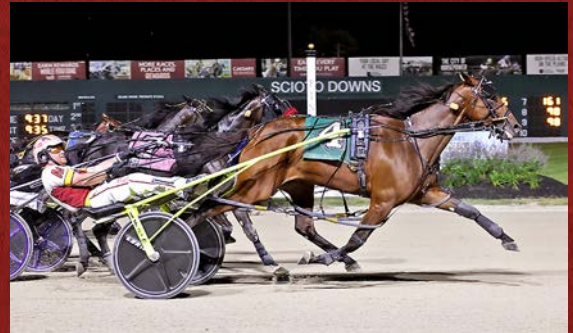
TARAPASTA 3-Year-Old Filly Pacing Champion