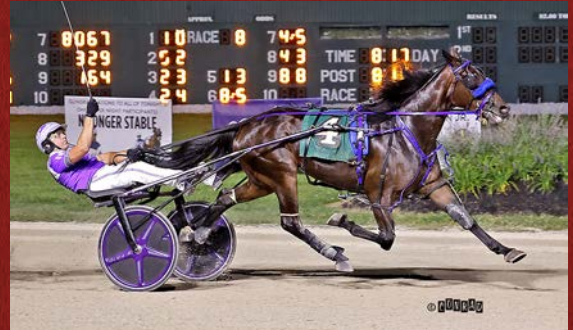
GRAND REVIVAL 3-Year-Old Colt Trotting Champion