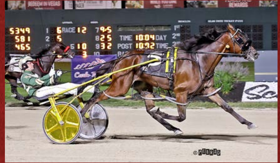
WICKED CHARACTER 3-Year-Old Colt Pacing Champion