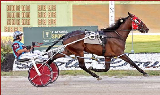
DAISY'S STAR 2-Year-Old Filly Pacing Champion