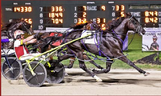
CLEVER CODY 2-Year-Old Colt Pacing Champion