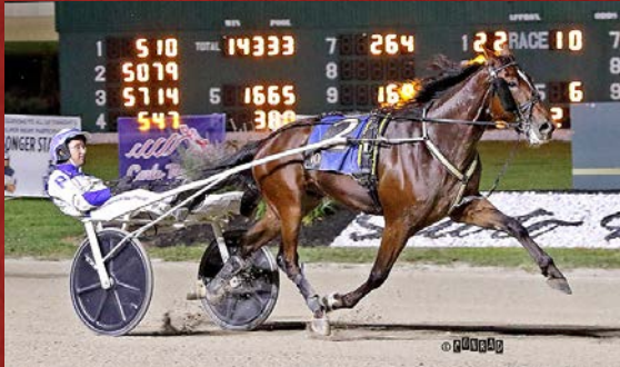
TENNESSEE TOM 2-Year-Old Colt Trotting Champion