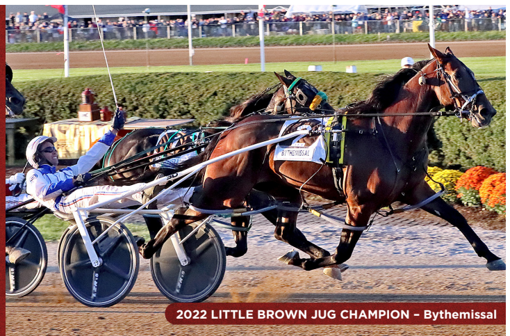
2022 LITTLE BROWN JUG CHAMPION – Bythemissal