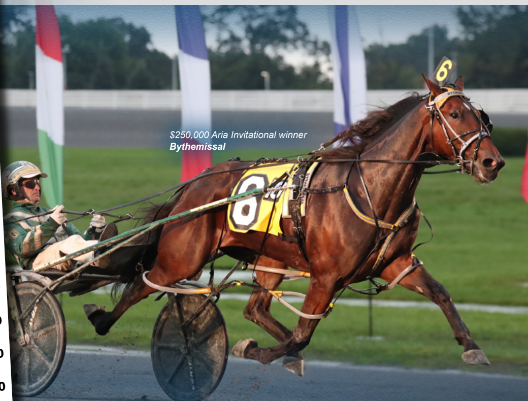
$250,000 Aria Invitational winner Bythemissal

Lexington Selected Grads rang up 23 wins in stakes races last weekend