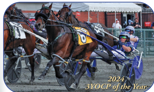
Aria Invitational, Robert Kane Pace winner CAPTAIN ALBANO p,3,1:48.1 ($1,928,194)

These recent Harrisburg Yearling Sale graduates are only a few of the many 2025 stakes winners that went through the Standardbred Horse Sales Company's sales ring.