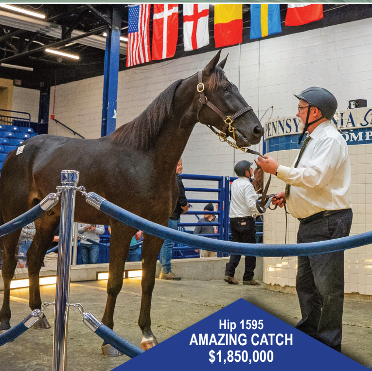
Hip 1595 AMAZING CATCH $1,850,000

The 2024 Harrisburg Mixed sale set a new gross sales record of $31,608,000 and an all-time average record of $52,945 from the two-day auction of broodmares, racehorses, weanlings, yearlings & stallion shares!