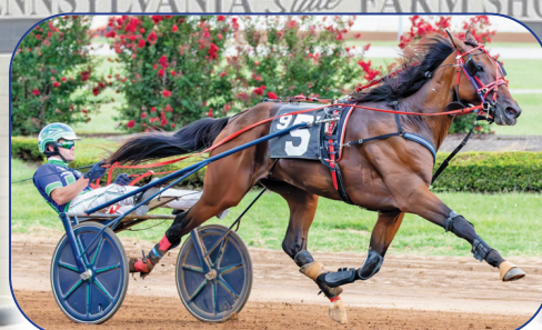
KYSS Championship Final, KYSS Final winner ENDURANCE 2,1:52.3-'25 ($557,450)