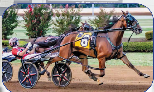
KYSS Championship Final winner TOPVILLE LUCKY p,2,1:50.2-'25 ($295,000)

LOOK FOR YOUR BIG STAKES WINNER THIS NOVEMBER!