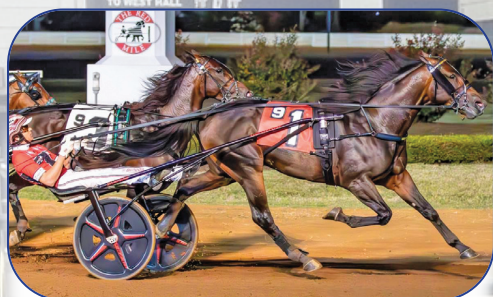
KYSS Championship Final, Beal, Yonkers Trot winner SUPER CHAPTER 3,1:50f-'25 ($1,459,765)