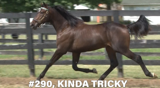
#290, KINDA TRICKY