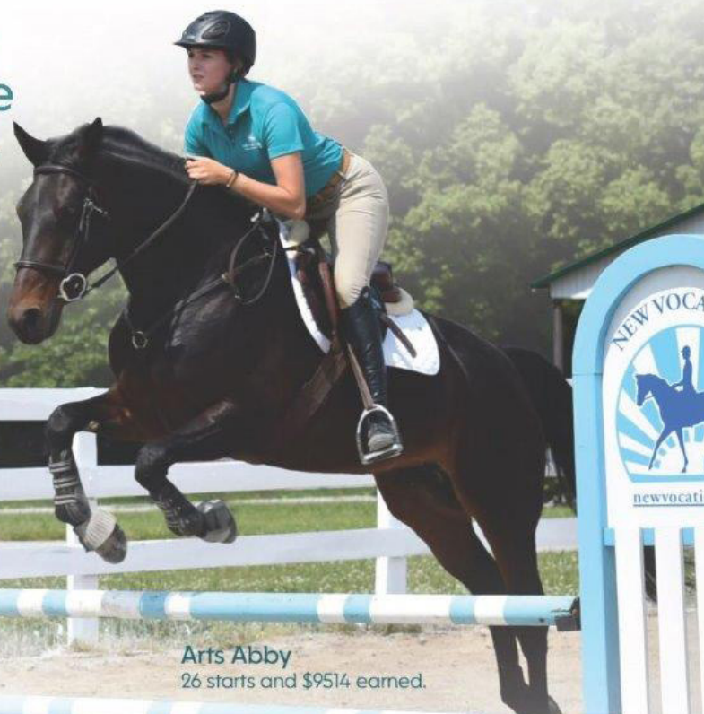
Arts Abby 26 starts and $9514 earned.